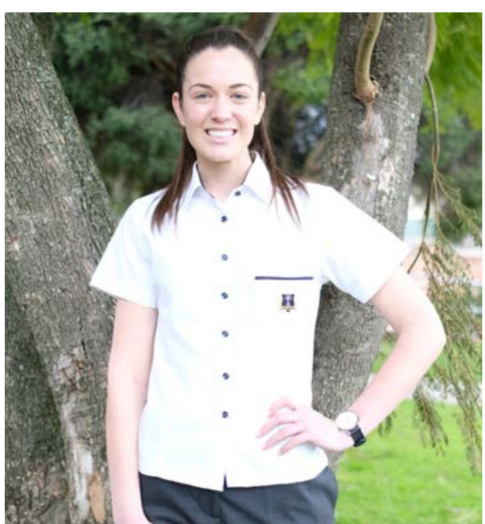
All students will be in the new uniform by 2020, with the exception of Year 12's for 2020.